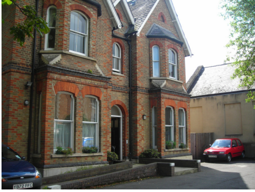
Brian Lewis House