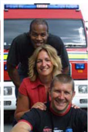
Members of the Oxfordshire fire training team

Back in September staff at Abbeyfield Oxford spent the afternoon with the Oxfordshire Fire Service learning about fire safety at work and at home. There were fire extinguishers to try out, (rather noisily in the car park) videos to watch, and a lot to think about!